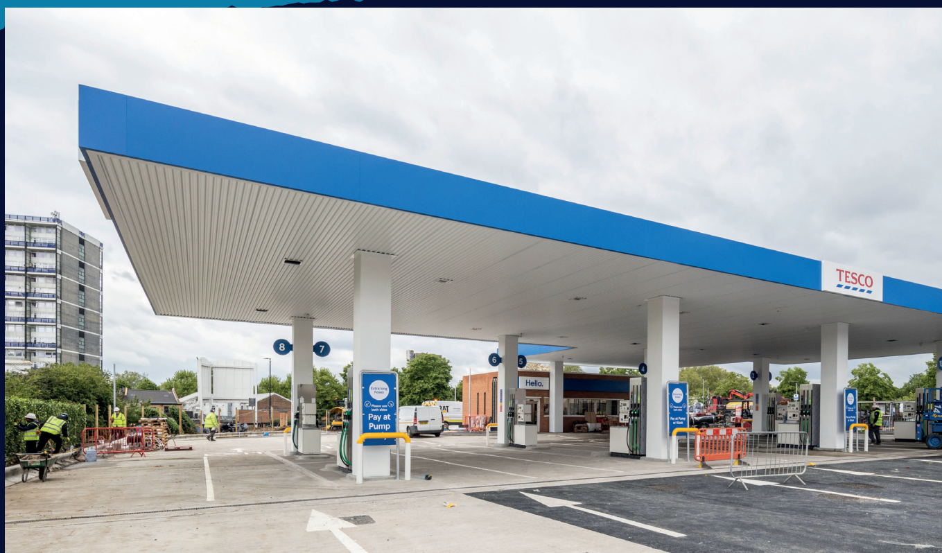
Finishing touches to the new Tesco Petrol Station, which was completed in June 2021-