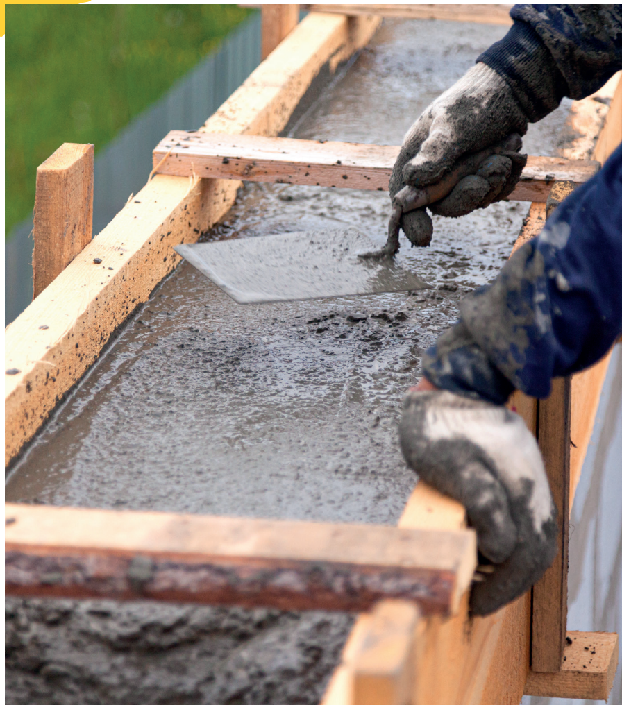
Training opportunities in formwork will be available

We will send you more information about the courses and jobs mentioned above as soon as they go live.