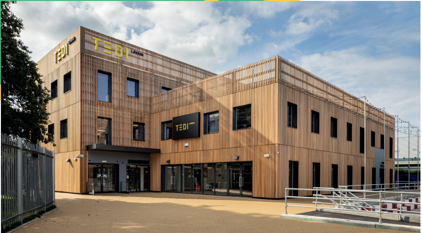
The new TEDI-London campus opened in September 2021

Thank you for taking the time to read our second site-wide construction update on the Canada Water development, which includes Surrey Quays Shopping Centre, Surrey Quays Leisure Park, Printworks, the former Rotherhithe Police Station and a small site off Roberts Close.