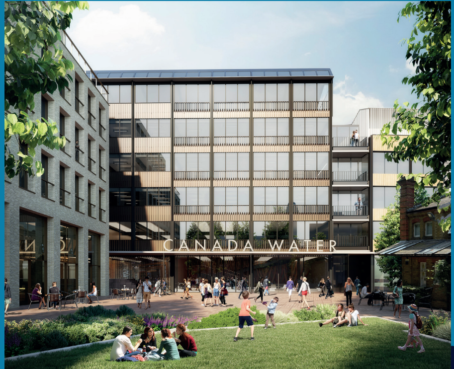
Illustrative image of Plot A2

Wates, who are building Plot A1 and Mace, who are building Plot A2, will be making themselves available at a set time and location each month to speak with those who want further detail and have questions. Please watch out for this being advertised via site signage, our e-newsletter and on our website.