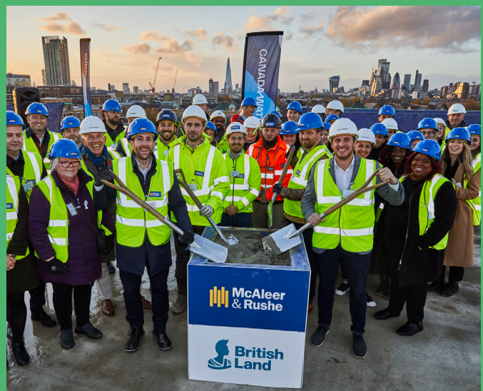
British Land, Southwark Council, and McAleer & Rushe held a topping-out ceremony on Wednesday 23rd November to celebrate Plot K1 reaching its full height

Construction work on Plot K1 began in winter 2021, carried out by our contractor McAleer & Rushe. We would like to thank all those living locally for their patience during the construction period.