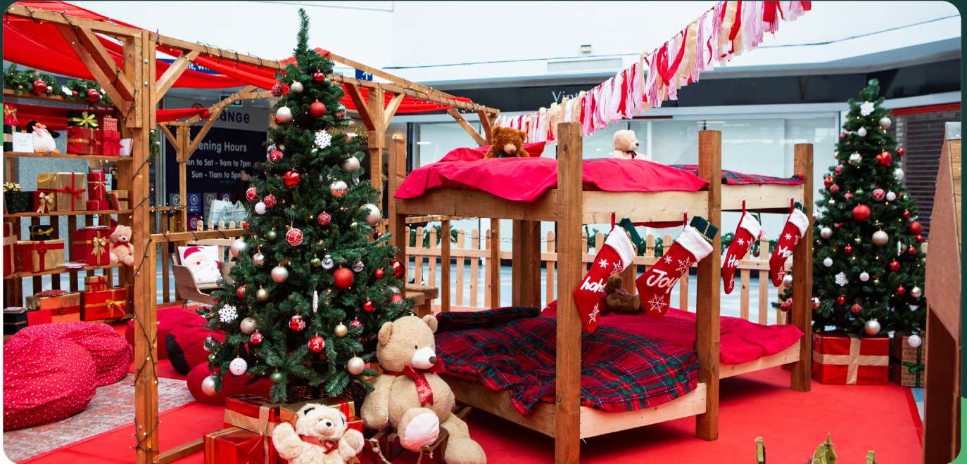
Santa has set up his HQ in Surrey Quays Shopping Centre. It's free to visit with no need to book in advance

Welcome to our winter community update on the Canada Water development – which includes the redevelopment of the Surrey Quays Shopping Centre, Surrey Quays Leisure Park, The Printworks and the former Rotherhithe Police Station.