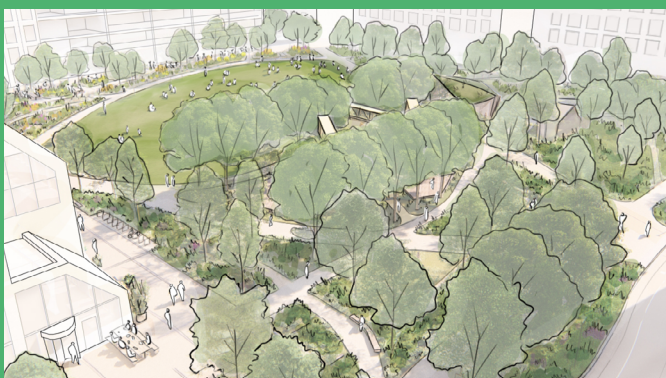
The new park will incorporate open space and woodland

We have drawn up detailed designs up for a new 3.5-acre park in the Canada Water development, on a space currently occupied by the Printworks warehouses.