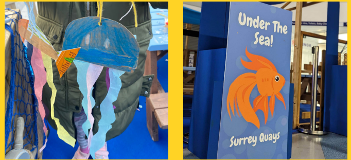
Children made jellyfish and other sea creatures

Kids were kept busy during February half term, with a free Under the Sea event at Surrey Quays Shopping Centre.