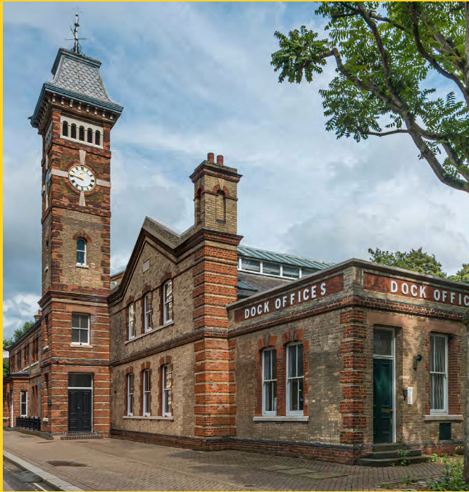
The marketing suite is open by appointment only

British Land has opened its new residential marketing suite, completing the restoration of the iconic Dock Offices building. The sensitive refurbishment continued the work begun at the Dock Manager's Office with designer Conran & Partners.