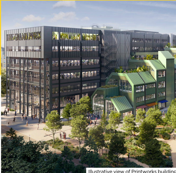
Illustrative view of Printworks building

Come and meet the team and learn more about our updated proposals for the Printworks building!