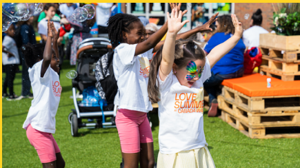
Love Summer was a big hit with families last year