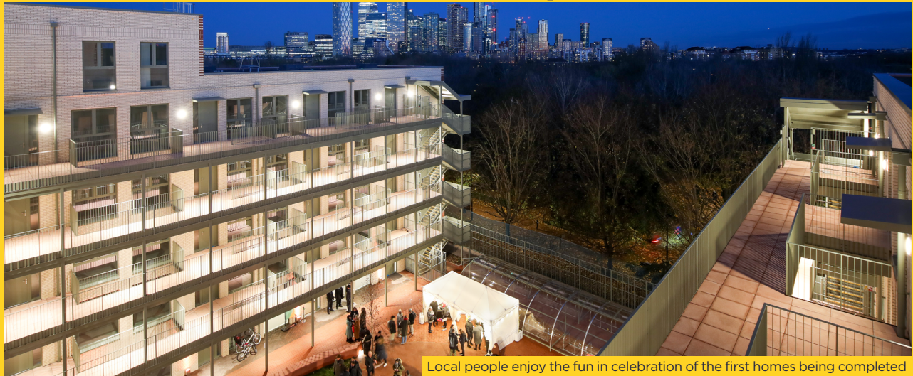
Local people enjoy the fun in celebration of the first homes being completed

The building at Plot K1 is the first permanent structure in the development to be finished and will provide 79 new homes for Southwark Council.