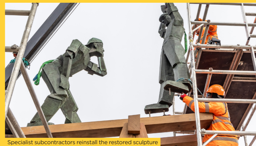
Specialist subcontractors reinstall the restored sculpture

The much-beloved sculpture showing two deal porters hard at work has returned to its rightful home in Canada Dock. It was taken to a specialist warehouse for restoration nearly a year ago as part of the dock revitalisation, and has now been reinstated with the cast bronze cleaned and treated, oak elements replaced and steel arc repainted.