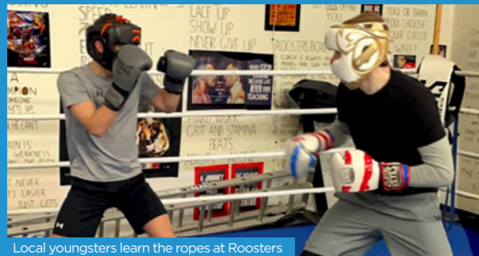
Local youngsters learn the ropes at Roosters

It isn't just about trying to produce world champions. It's about the community feel, it's about bringing kids in. With a boxing club it brings all creeds and cultures under one roof."