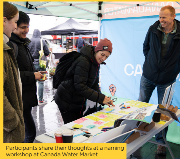
Participants share their thoughts at a naming workshop at Canada Water Market

In March, we enjoyed meeting people from the area at a series of workshops, aimed at helping us come up with names for the new streets and spaces in the development to put forward to Southwark Council. We spoke to over 300 people from a wide variety of backgrounds, at workshops held at the Docklands Settlements, Bacon's College, The Finnish Church, Time & Talents (T&T) and local markets, as well as engaging with schools and hosting workshops online.