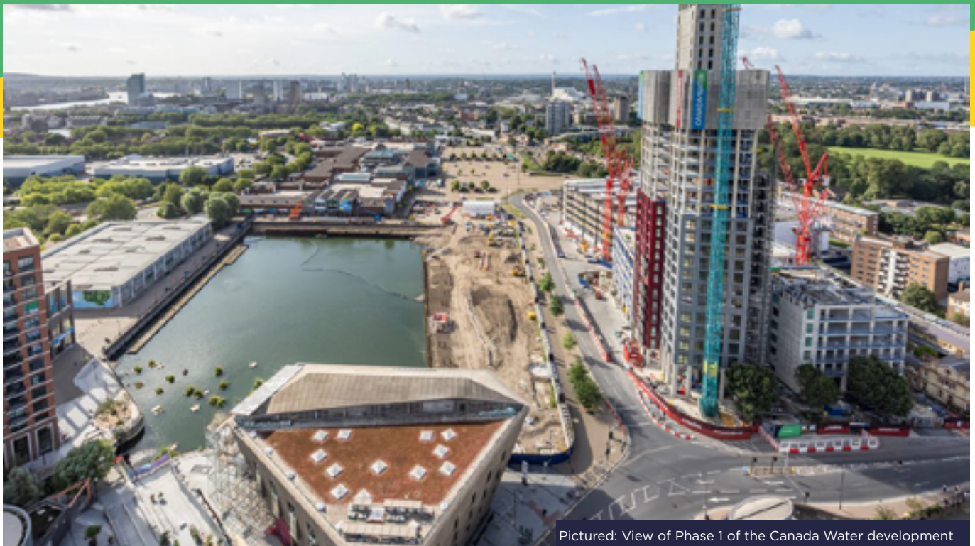
Pictured: View of Phase 1 of the Canada Water development

Welcome to our latest newsletter providing an update on the delivery of British Land's 53-acre Canada Water development. This edition focuses on activity relating to the active construction sites known as Plots A1, A2, K1, Canada Dock, Printworks site and other enabling works across the development. We know that at times construction activity impacts the local community and we thank you for your ongoing patience – we are committed to keeping you updated and managing construction so that disruption to the local area is minimised as far as possible.