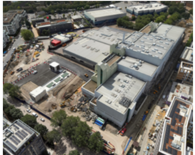
Pictured: View of the completed substation structure along Quebec Way in the left corner

UK Power Networks began cable installation works within Southwark last year. These new cables will supply the electricity for the new substation. Notice will be provided by letter to those in close proximity to the site ahead of works conducted by UK Power Networks