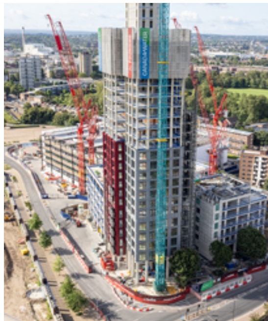
Pictured: Installation of façade of The Founding continues

Please see the project timeline below for more information on the stages of work through to completion.