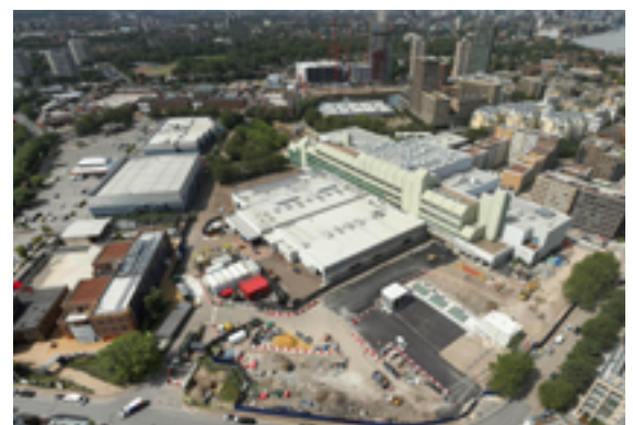
Pictured: View of Zone H and Zone L from Quebec Way.

Construction of new access roads and the installation of new below ground infrastructure to facilitate the development is ongoing in the Printworks area. All works in this area are now taking place within the site boundary and include drainage and service installation works and tarmacking of the new roads. Construction of the new roads is anticipated to complete in summer 2024.