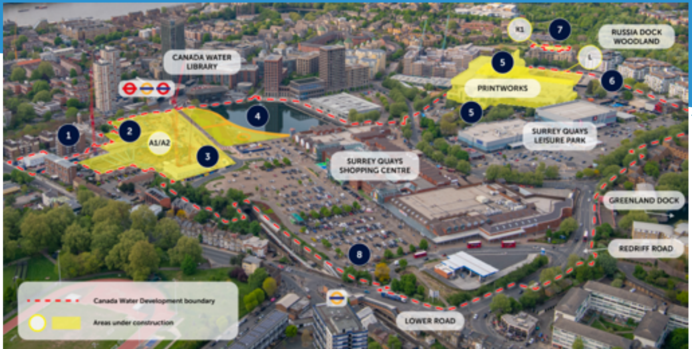
Pictured: The red line on the image above reflects the Canada Water development boundary. Please note that the locations of the labels are indicative.