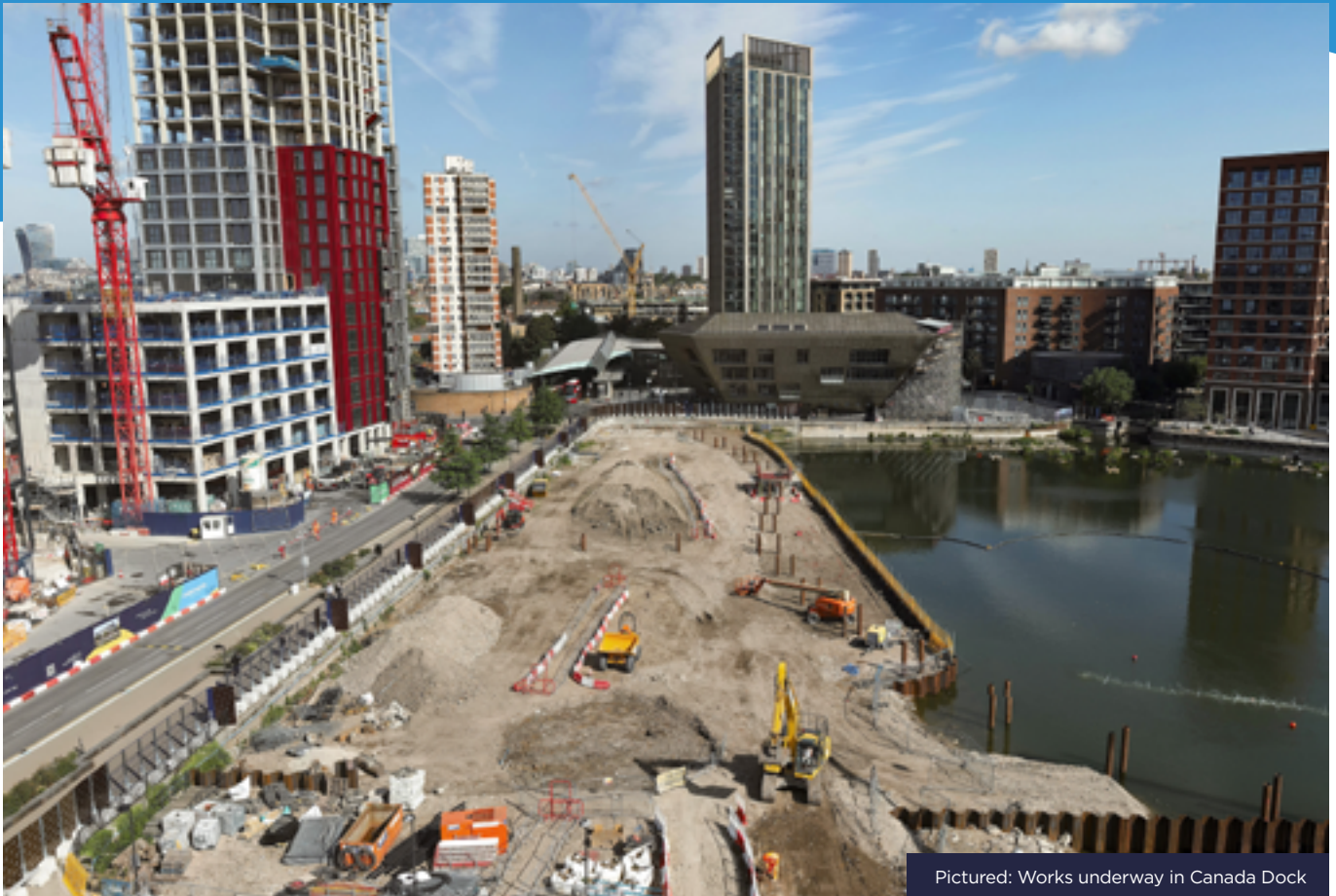
Pictured: Works underway in Canada Dock