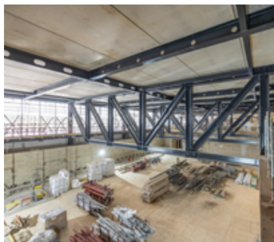
Pictured: Work underway in the new Canada Water Leisure Centre sports hall

Within the building, the blockwork is finished in the basement, and the support props have been removed from within the sports hall. With the floor plates and structures reaching completion, the beginning of mechanical, electrical, and plumbing systems will start, initially in the basement of the building and then at the ground level. In addition to this, plant and other equipment will begin to be delivered, which will start on level four and then continue to the other commercial spaces.