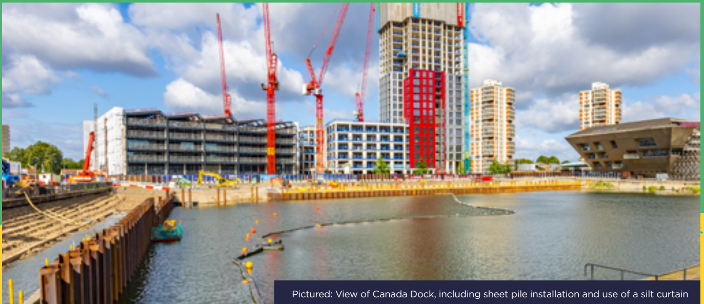
Pictured: View of Canada Dock, including sheet pile installation and use of a silt curtain

Works being carried out by contractor Galldris in and around the dock are outlined below. Work is also being carried out by Southwark Council on Canada Water Library and while this is separate to the development, Galldris is coordinating closely with them to minimise disruption.