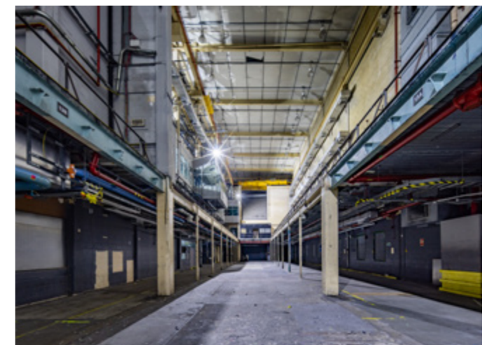
Pictured: The inside of the Printworks building

In the Printworks area, construction of new access roads and the installation of new below ground infrastructure to facilitate the development is ongoing. All works in this area are now taking place within the site boundary and include drainage and service installation works and tarmacking of the new roads. The roads are expected to be complete in summer 2024 for construction traffic access. The roads will remain within the construction site boundary and will be resurfaced before opening to the public upon completion of the main works to the Printworks building.