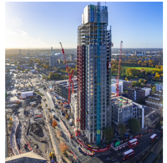
Pictured: Façade installation of The Founding continues

Please see the project timeline on the right for more information on the stages of work through to completion.