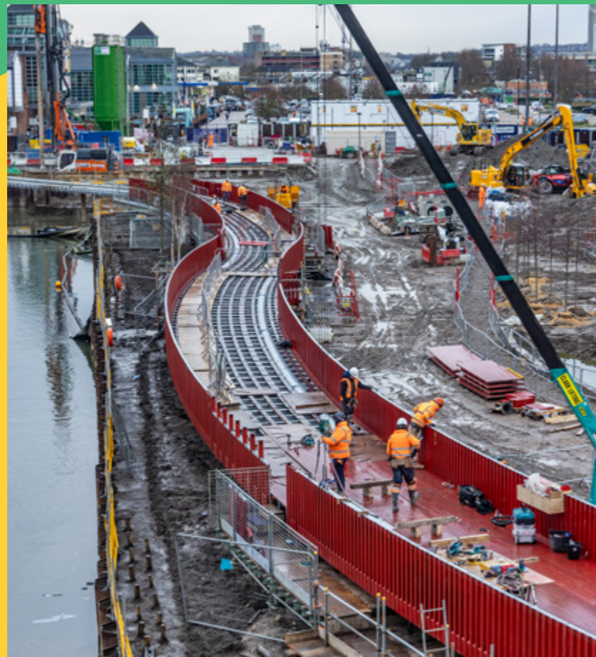
Pictured: Boardwalk construction underway in Canada Dock

Protective measures are in place to reduce the impact of construction on the water habitat , including bubble and silt curtains.