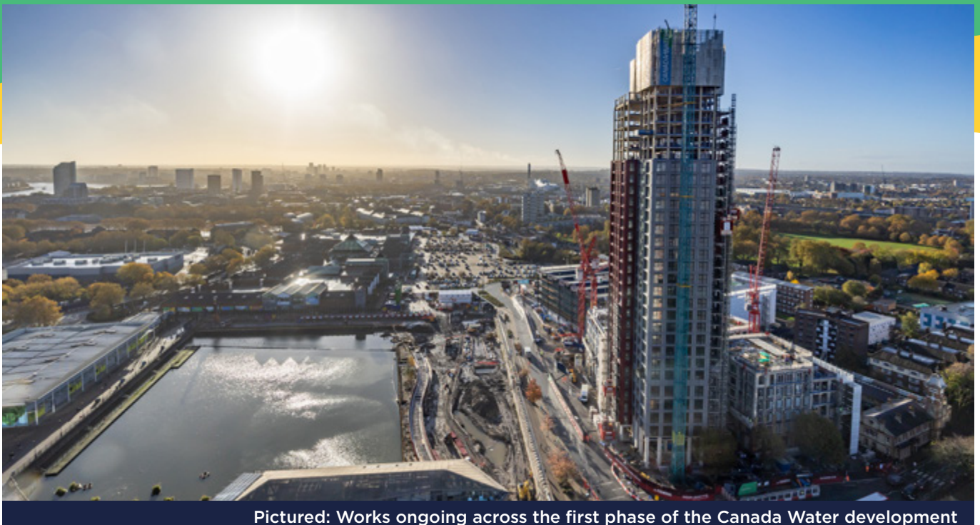
Pictured: Works ongoing across the first phase of the Canada Water development

Welcome to our latest newsletter providing an update on the delivery of British Land's 53-acre Canada Water development. This edition focuses on the active construction sites known as Plots A1, A2, Canada Dock, Printworks building and other enabling works across the development. We appreciate there are times when construction activity impacts the local community so thank you for your ongoing patience. We are committed to keeping you updated and managing construction so that disruption to the local area is minimised as far as possible.