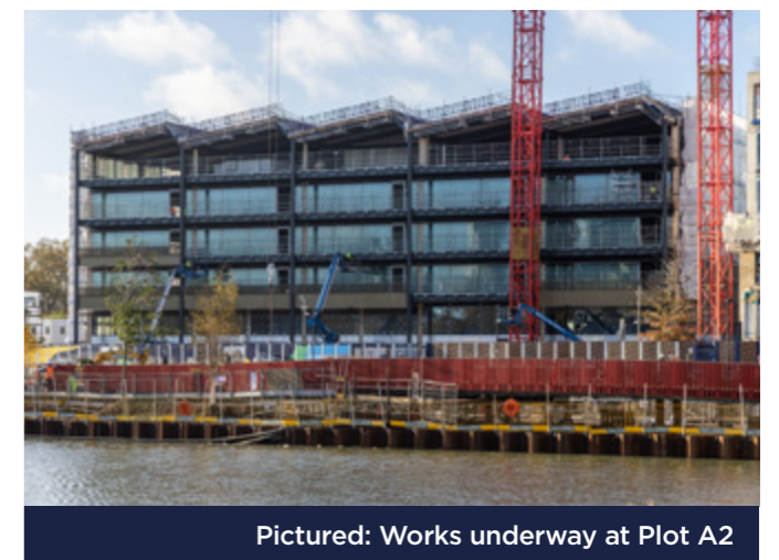
Pictured: Works underway at Plot A2

Please see the project timeline below for more information on the stages of work through to completion.