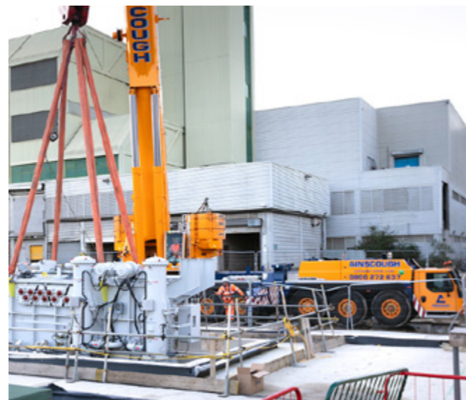
Pictured: Positioning of a transformer into the below ground substation

UK Power Networks began cable installation works within Southwark last year. These cables will supply the new substation from the nearby New Cross Substation where upgrade works are underway. Notice will be provided by letter to those in close proximity to the site ahead of works conducted by UK Power Networks.